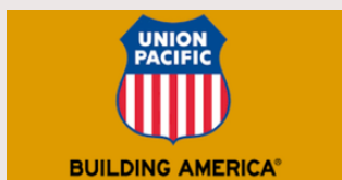
Union Pacific Community Ties Giving Program

We extend our deepest gratitude to all our generous donors and supporters. Your contributions enable the Monterey County Search and Rescue team to continue our vital work, ensuring the safety and well-being of our community. Your support is a lifeline to those in need, and we couldn't do it without you.