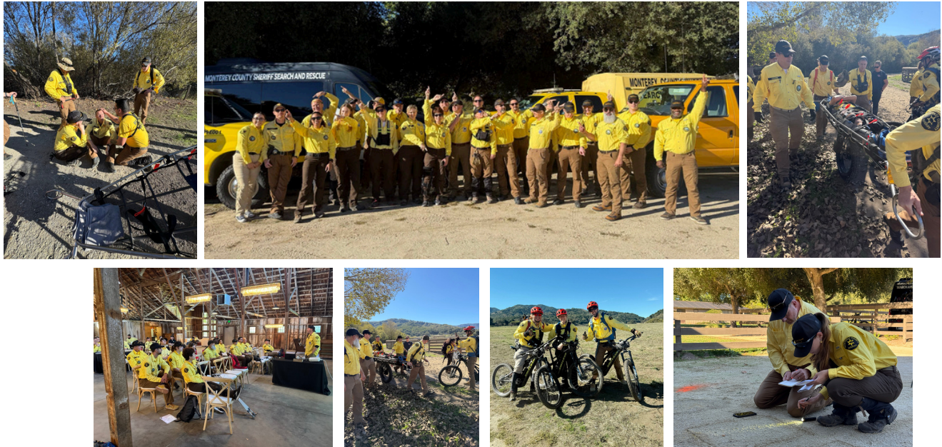
November Training at Santa Lucia Preserve