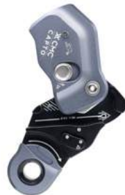
The CMC Capto is a versatile carabiner with built-in rope management features, ideal for streamlining rescue systems. The CMC Aztek is a compact, multipurpose pulley system used for creating mechanical advantage and managing loads efficiently during rescues.

These additions were made possible thanks to the incredible generosity of our donors and the grants we have received. With this equipment, we are better equipped to respond to emergencies in challenging terrains while reducing the burden on our team members. Thank you for supporting our mission and helping us enhance the safety and efficiency of our rescues!