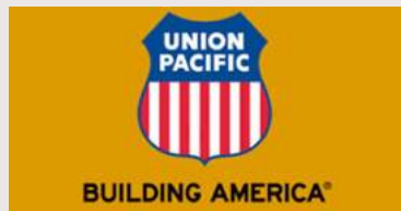
Union Pacific Community Ties Giving Program

We extend our deepest gratitude to all our generous donors and supporters. Your contributions enable the Monterey County Search and Rescue team to continue our vital work, ensuring the safety and well-being of our community. Your support is a lifeline to those in need, and we couldn't do it without you.