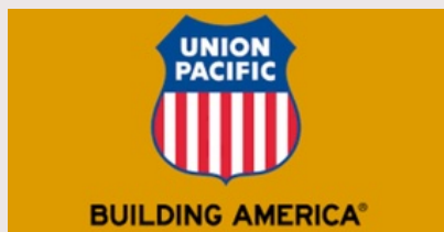
Union Pacific Community Ties Giving Program

We extend our deepest gratitude to all our generous donors and supporters. Your contributions enable the Monterey County Search and Rescue team to continue our vital work, ensuring the safety and well-being of our community. Your support is a lifeline to those in need, and we couldn't do it without you.