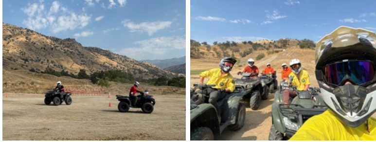
California SAREX 2024