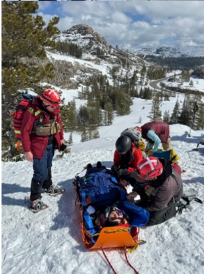
Snow & Ice Recertification