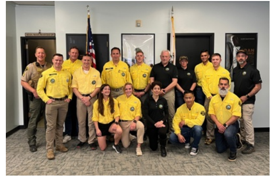
New Recruits Sworn In