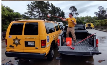
Basic Ropes Training & Equipment maintenance