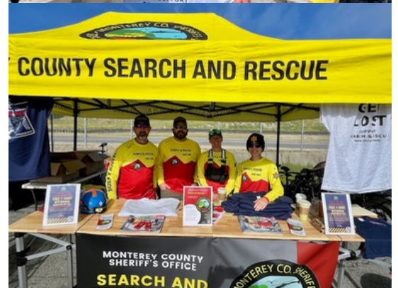
2024 Sea Otter Classic PSAR (Preventative SAR)